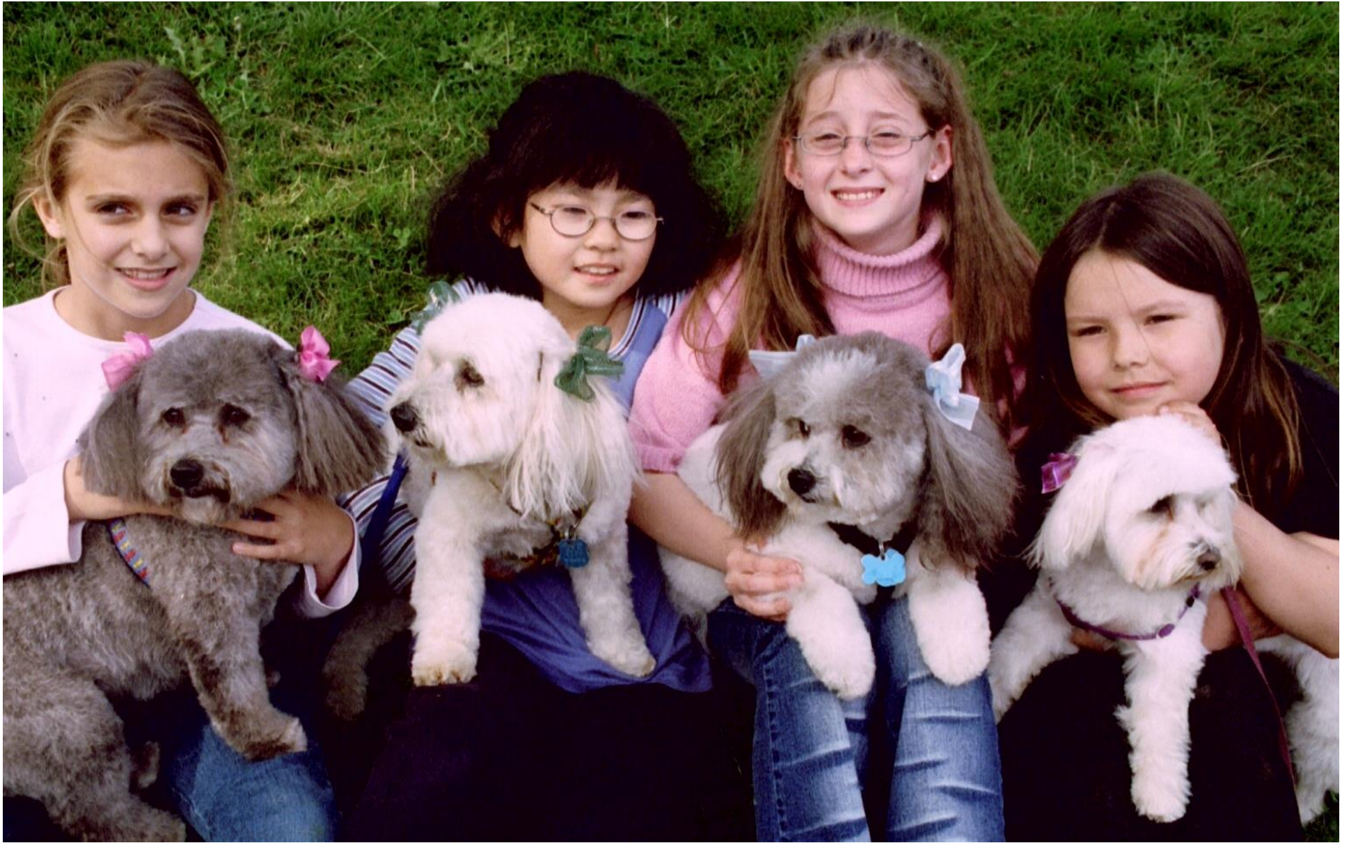
A dog that wears satin bows...