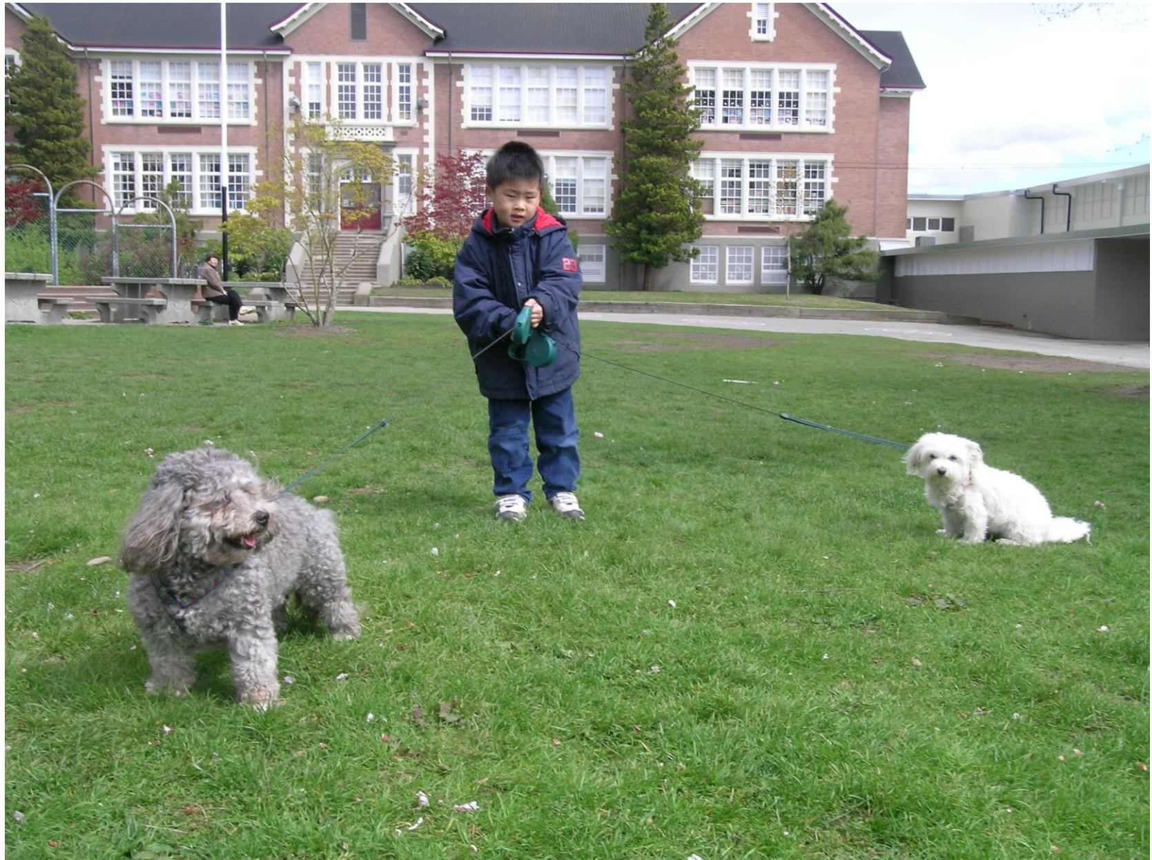
A dog I could hold with a leash...