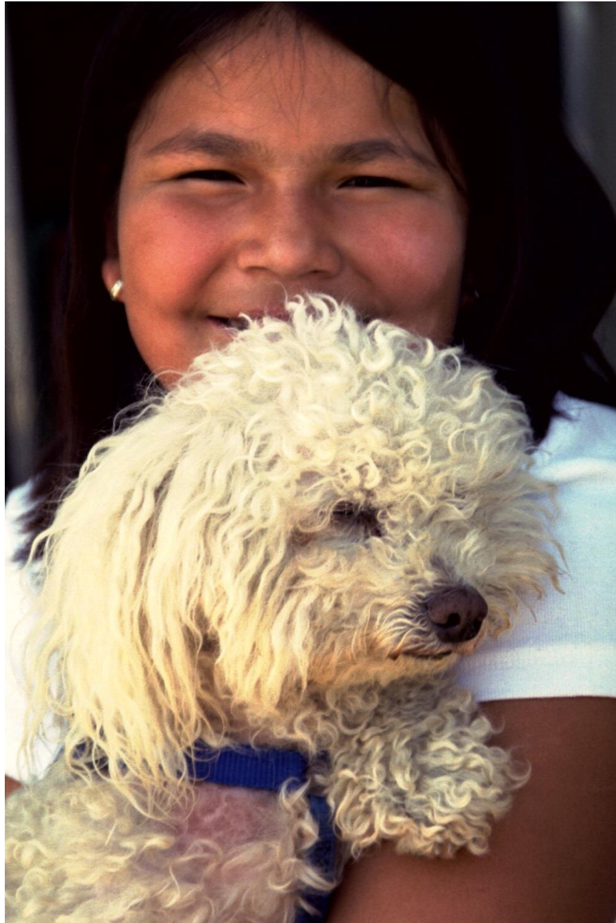
A dog with fluffy fur...