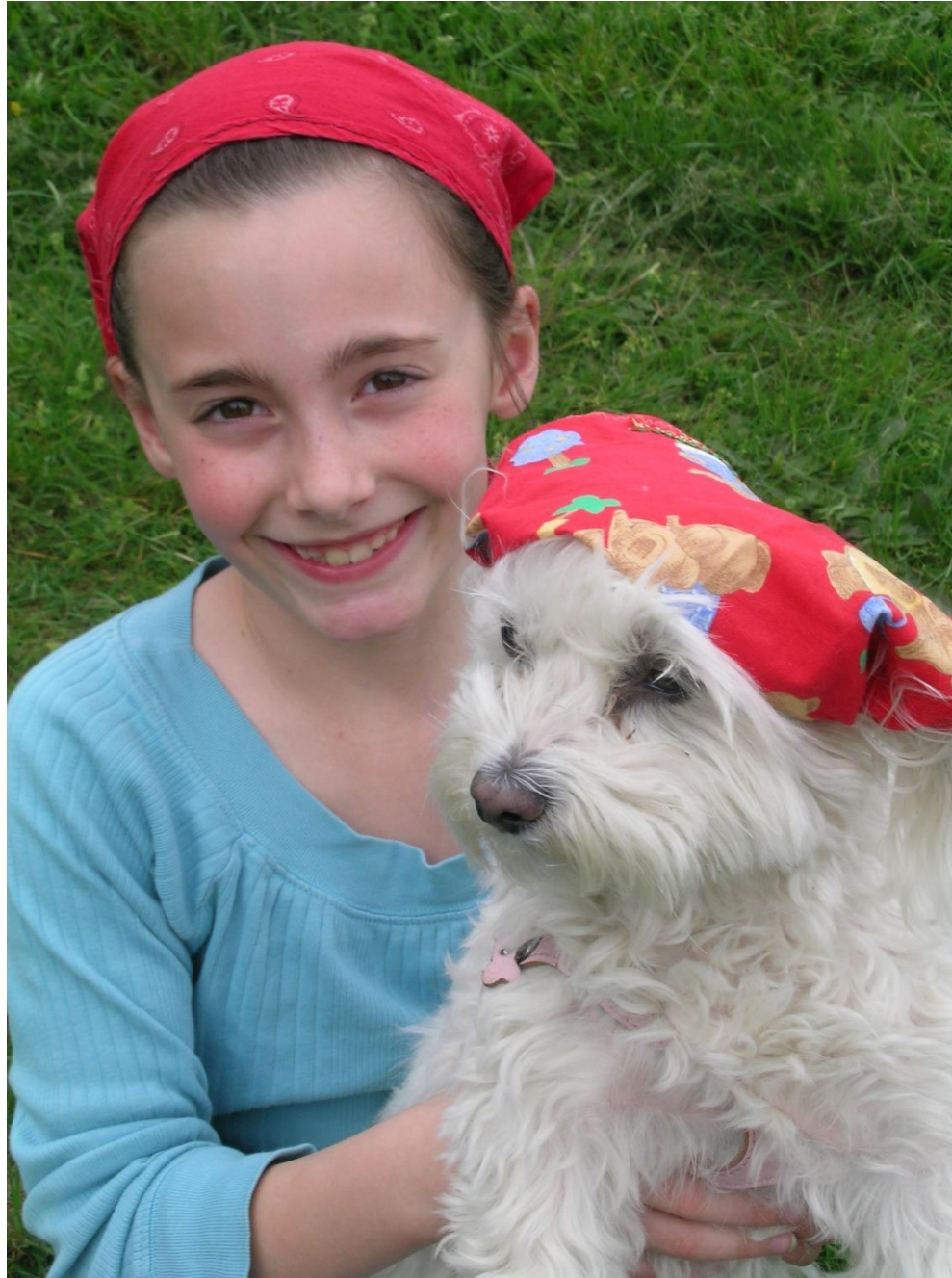
A dog that could wear the same bandana as me...