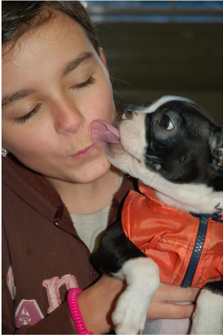
A dog that will lick my face...